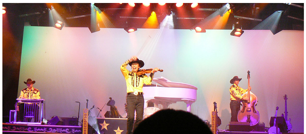
A country and western fiddle player of Japanese extraction just struck me as unusual – and he was very good.