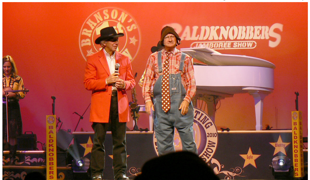
“Country boy” comic with MC straight man. Interesting word plays and twists, not slap stick but definitely not Las Vegas “sophistication” either.