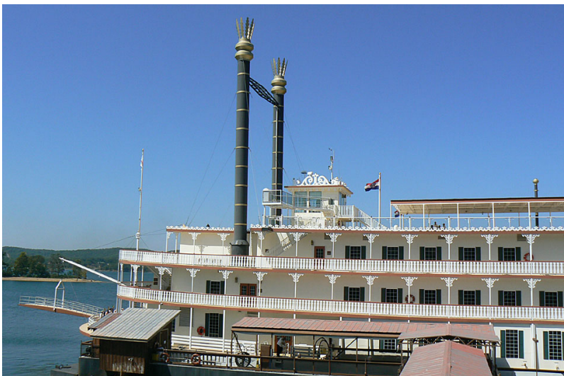
Lunch and a very good variety show on a 3½ hour river boat cruise just south of Branson. Great singing and good dancing, definitely worth both the price and the drive. For a bit extra you can have your own box – recommended.

In both years, our biggest problem was our timing. When the schools open in late August the tourist volume drops drastically until the fall season starts in mid-September. This is good in that hotel prices are down, the traffic on “the strip” is minor, and you can get into most any show without reservations. The bad news is that during this slow period many of the shows either go on vacation or use understudies to fill the ranks, some of the restaurants close for a few weeks, and maybe the entertainer or show you really