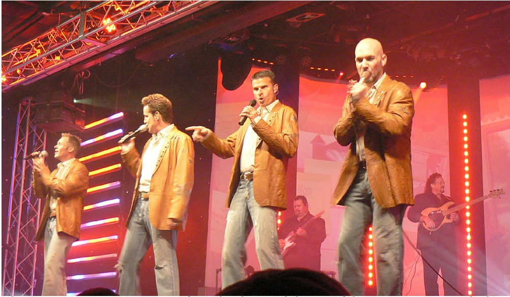
The Pierce Arrow singing group from the show and theater of the same name – per the hotel people the hottest show in town. Good show and bass (second from right) great, not our favorite show but definitely worth the price and then some.

settling in as experienced professionals, some with whole shows they have put together while others work in established shows like the very good variety show on the Steamboat Branson Belle. As the song says, “Something for everyone”.