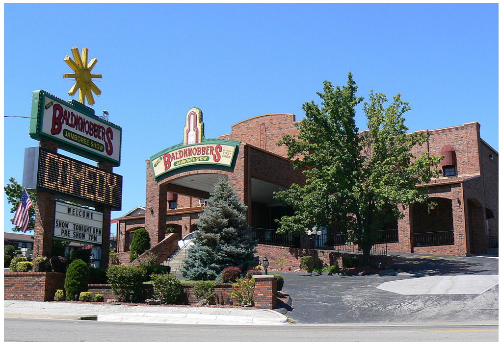
Theater portion of the Baldknobbers complex. Seats 800 plus. Note the PreShow. This is a well done warm up, almost a show in itself.

Just as there is a variety of entertainment, the background of the entertainers is a bit unusual. There are some acts that come in for specific time slots, but many of the performers call Branson home as well as a place to work. We greatly enjoyed a singer with a Broadway and opera background who after sixteen years of being on the road decided he wanted a life with his wife and five kids (obviously he was not on the road all of the time). He moved the family to Branson and only works in his own shows there. We saw and heard an excellent traditional country and western music trio. The leader is a recognized member of the Hall of Fame in Nashville and a veteran of the “Opry” there. He also tired of the road, moved to Branson, and has been producing C&W music shows in Branson for fourteen years. There are several shows that feature a particular family perhaps augmented with other talent. One of these has been doing their show in Branson for 50 years. There are also younger performers who are just