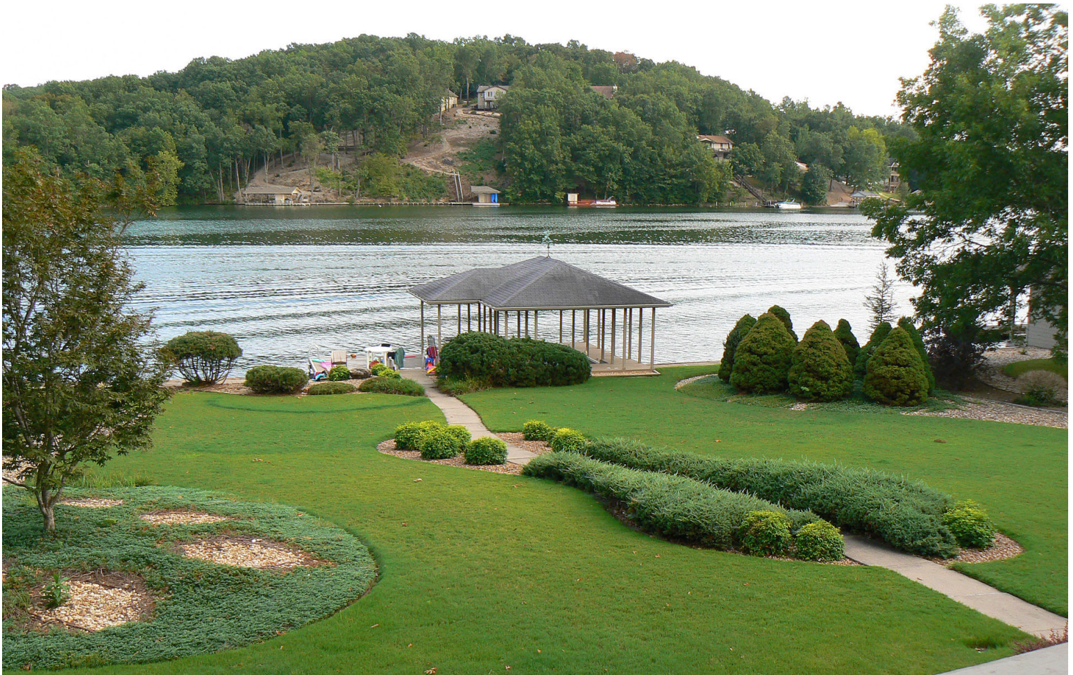
Arkansas lake site for the 2011 “Routon Tradition” week-end. Easy in (82 degree) water and shallow for standing and games. Note house on top of hill across the lake – a fast slide into the lake maybe but a real climb back.

As I briefly mentioned in the last edition of RRR, we did take advantage of our time in Arkansas to make a “non-family” trip to the resort area of Branson in Missouri. I promised a report and the report is we liked it enough that we made a second visit this year. Branson is a very interesting, small city in the eastern end of the Ozarks that has developed into a family and “elderly” resort area. There are lakes, amusement parks, and lots of live entertainment together with the hotels, condos, and restaurants needed to support all of