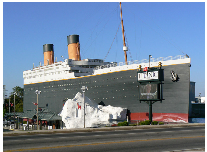
Not sure what goes on here but it is the landmark in town. Whenever you ask for directions they always seem to include “go down to the Titanic and...”. Appears to be a museum but we did not investigate.