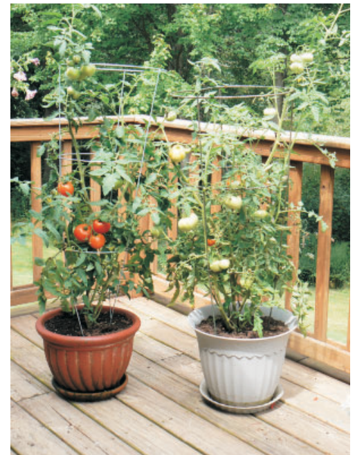
Our extensive vegetable garden – we doubled the “acreage” this year.