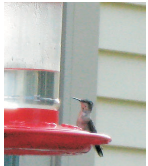
Sally finally got her bird, but not humming.