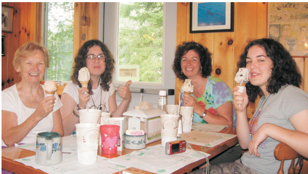
The Brits (and Helen) do like the ice cream.